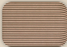
Spring Pin Side-by-Side Design